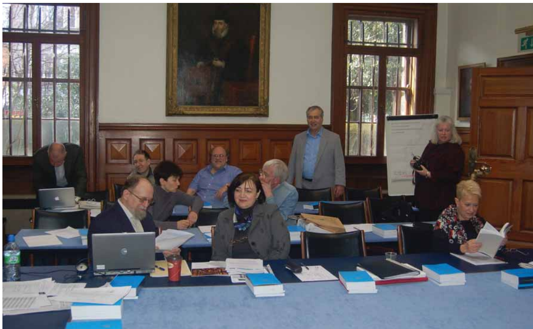
EAAS Board Meeting