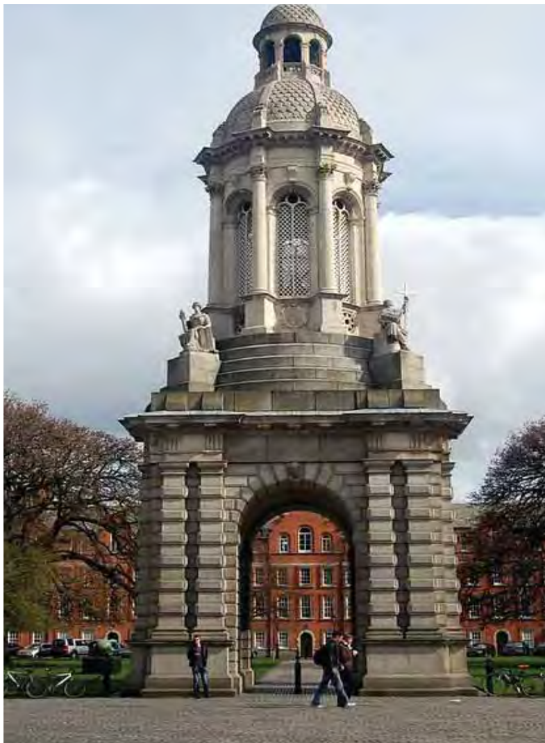
The Campanile at Trinity College (1853)

Phone: +44 1482 465287 Fax: +44 1482 466107 E-mail: virden@eaas.eu