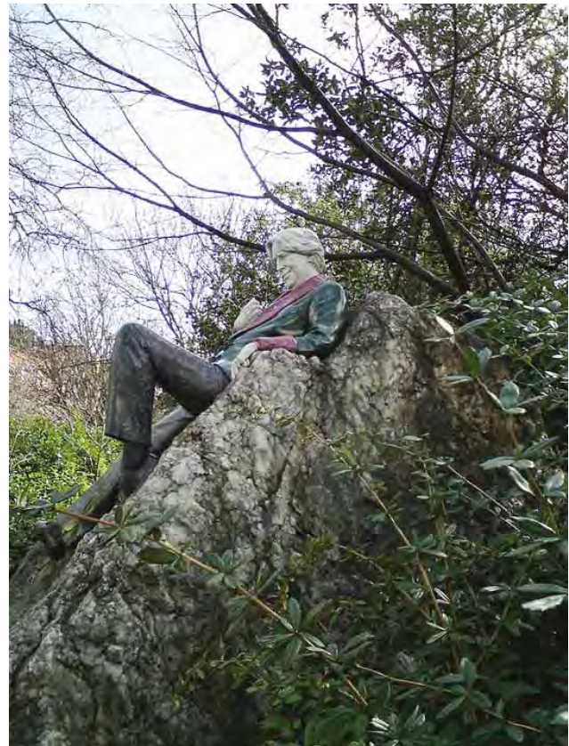
Statue of Oscar Wilde, Archbishop Ryan Park, Merrion Square, Dublin