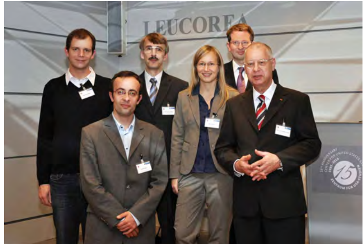
The President and his team celebrating 15 years of the Halle-Wittenberg Center for United States Studies, Nov. 20, 2010