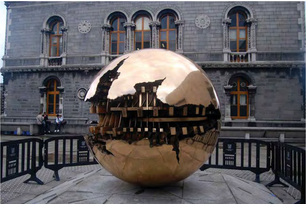
Sphere Within Sphere by Arnaldo Pomodoro, outside the Old Library of Trinity College, Dublin