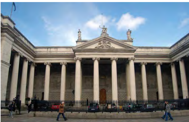
The 18th century Irish Houses of Parliament, now the Bank of Ireland, College Green, Dublin

Warm greetings to all, Hans-Jürgen Grabbe