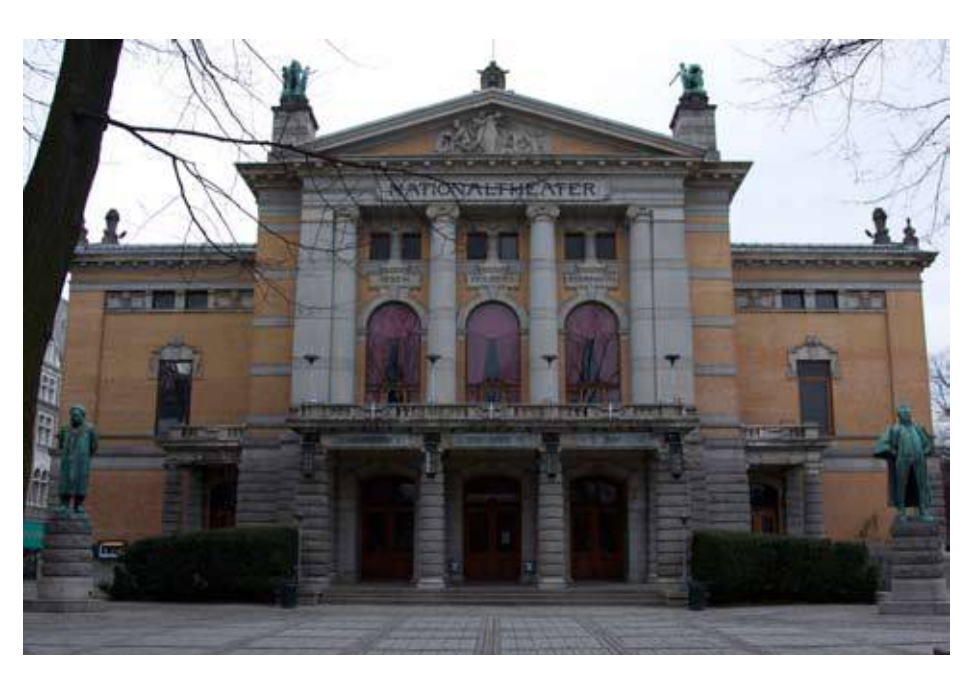
The National Theater in Oslo