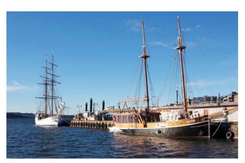
The harbor in front of Oslo City Hall