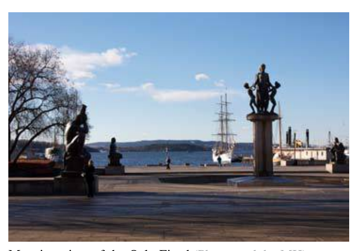
Morning view of the Oslo Fjord