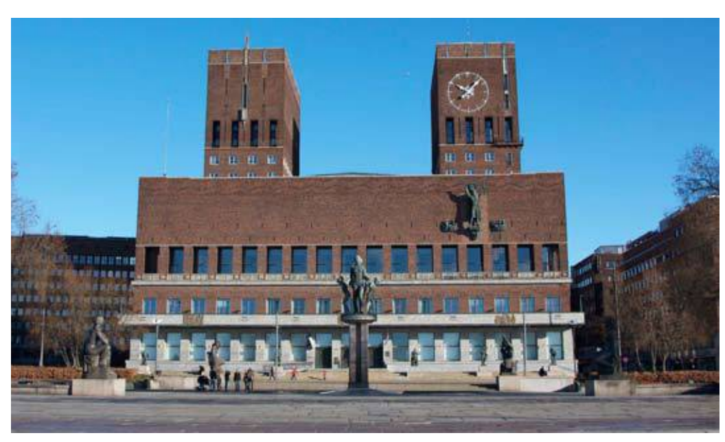
Oslo Town Hall, viewed from the waterfront

Please consult the conference materials you will be receiving upon registration for further information regarding, e.g. restaurants, sightseeing, etc.