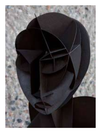
Sculpture head on Blindern Campus

the speakers in any workshop, not more than two may come from the same country. Speakers must be members of their national Association for American Studies if there exists one in their home country. Speakers from Canada, Israel, Japan, and the USA must be members of their respective American Studies Associations. No speaker can present more than one paper at the conference.