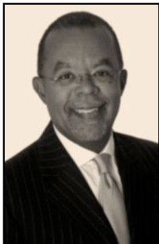
Henry Louis Gates